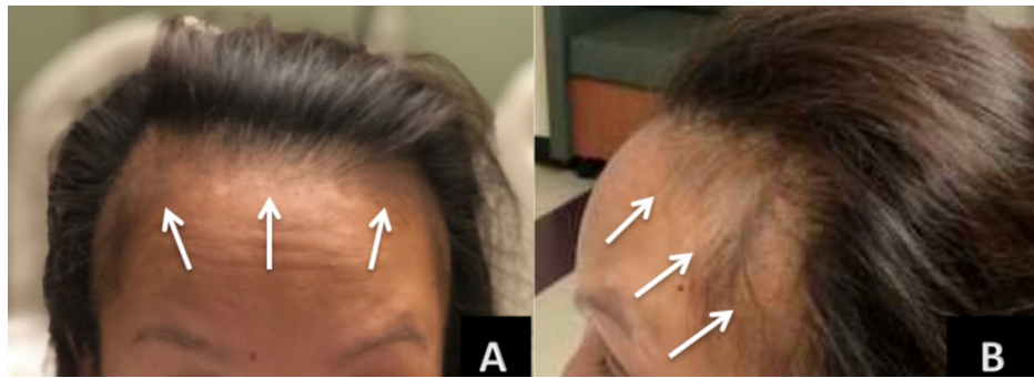
FIGURE 1: Non-scarring frontal alopecia

(A) Non-scarring alopecia is present on the frontal marginal region (arrows) of the scalp. (B) Marginal alopecia involving the frontal temporoparietal region (arrows) of the scalp.