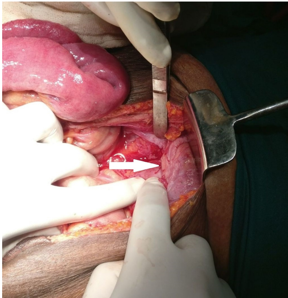
FIGURE 2: Dense fibrotic band causing small bowel obstruction (arrow)

Both the mesenteric granular mass and the dense fibrotic band were excised, a right salpingo-oophorectomy was conducted, and resected specimens were sent for histopathological examination. On microscopic examination, the Actinomyces species was identified in the evaluated specimens, and a final diagnosis of abdominopelvic actinomycosis was made (Figures 3A-3E).